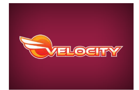
Velocity SKYCITY Hamilton Northern Premier League Champions Trophy T20 Team