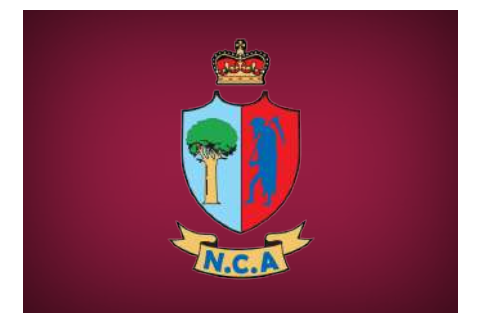
Northland Brian Dunning Cup