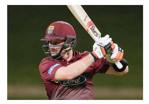
Henry Cooper Ford Trophy One-Day Player of the Year