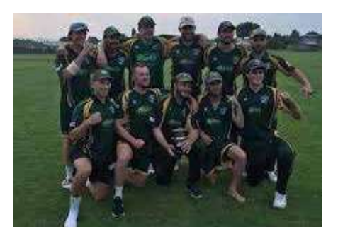
Mount Maunganui CC Eric Petrie Cup