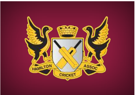
Hamilton Fergus Hickey Rosebowl